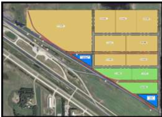
FDL has 130 acres in our Industrial Park available for your development.